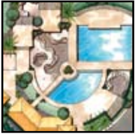
The Highlands (p. 1)