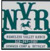
Nameless Valley Ranch (p. 2)