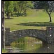
Golf Course Improvements (p. 6)