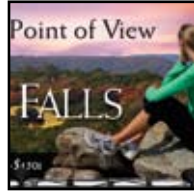
Austin's New Point of View (p. 8)

NEW Crystal Falls HOA Community Newsletter: The View at Crystal Falls, Vol. 1 • OCT 2006