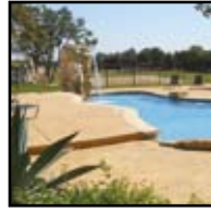
New Pool Key Card System (p. 2)