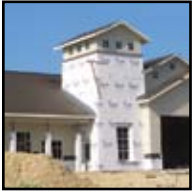
Fire Station Update (p. 5)